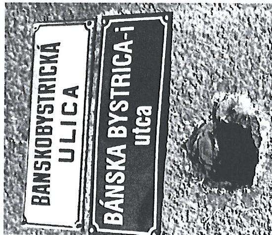
Fig. 3. A street-sign in Nové Zámky/Ersekújvár, Slovakia in 2011

attempts to use transliteration to sever the connection between Hungarians and their history are alive and kicking. 8